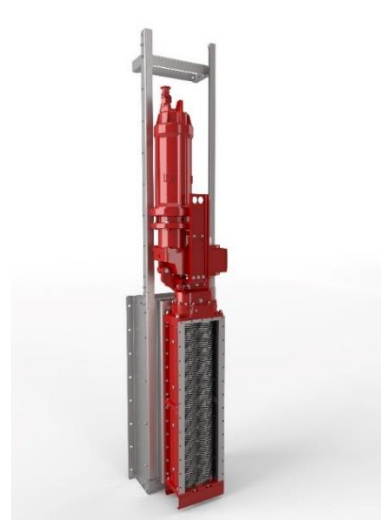
Image 3: The extra narrow XRipper XRC100 with a sewer integration kit (SIK) for very confined channels.