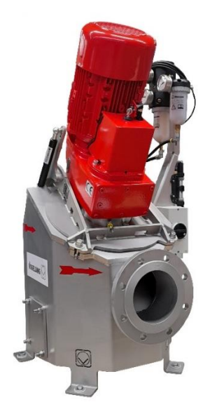
Image 5: The modified inline variant of the macerator RotaCut RCQ can be easily retrofitted in pipelines. The service flap can be positioned flexibly.